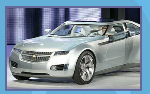
Chevy Volt : production in 2010 -now says 2009 demo fleets.

Without "The Brick" for $3,995, would we have the Razr & iPhone?