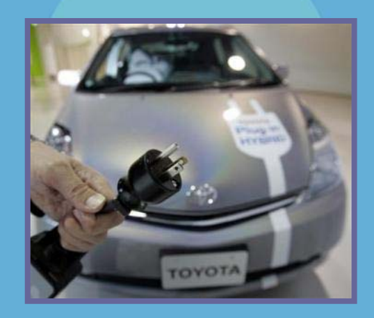
Toyota: maybe 2010 – why not in 2009?