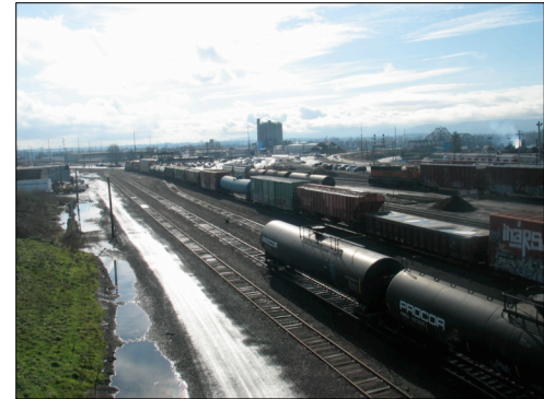
Vancouver Rail Yard